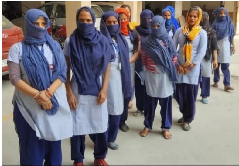
Some beneficiaries arriving at the drive