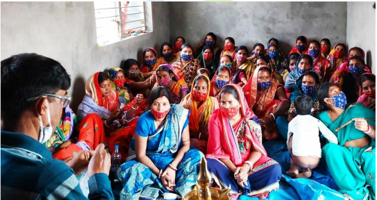
Trainees pictured at the session