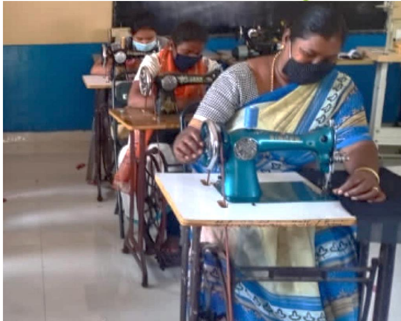
Workers and trainees pictured at the tailoring centre