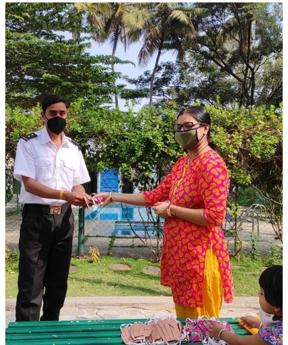
Mask distribution to a security guard

She distributed masks among all the staff working in the cleaning and maintenance departments, as well as to the security guards and visiting domestic helpers in the apartment. This endeavour was in partnerships with White Field Lions Club.