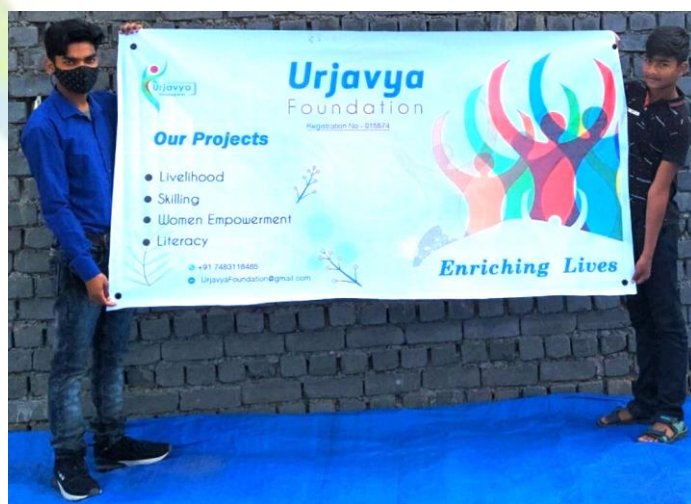
Volunteers holding the Urjavya Foundation banner for the event