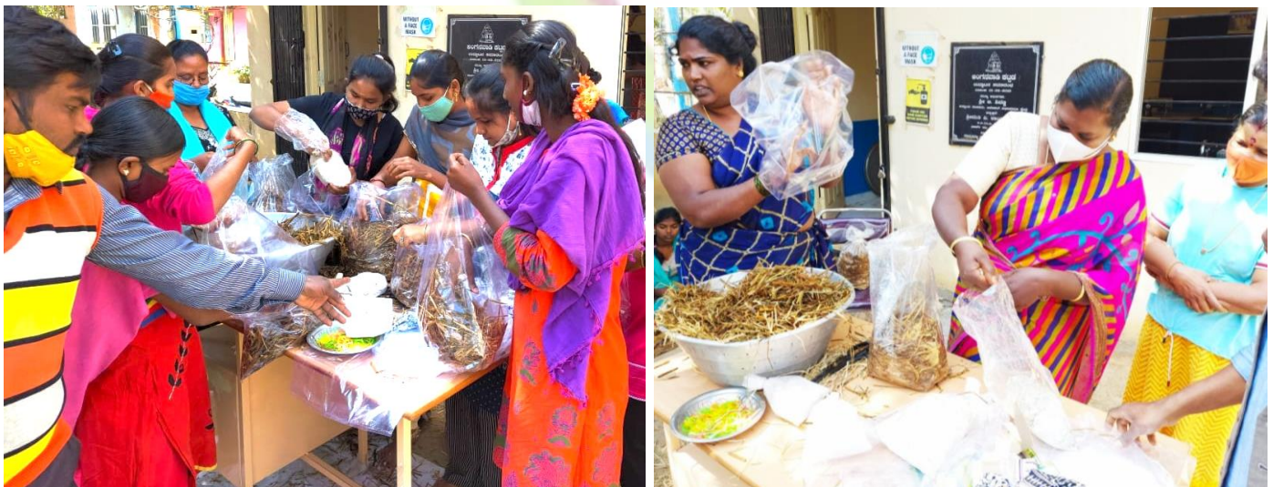
Kudlu women pictured during the hands-on training process

We also ensured to include younger girls in the training to give them training that will be useful for vocational purposes. These programmes shall impart significant positive impact on the lives of the beneficiary women and provide sustainable livelihood options for them. Financial inclusion of unemployed women and