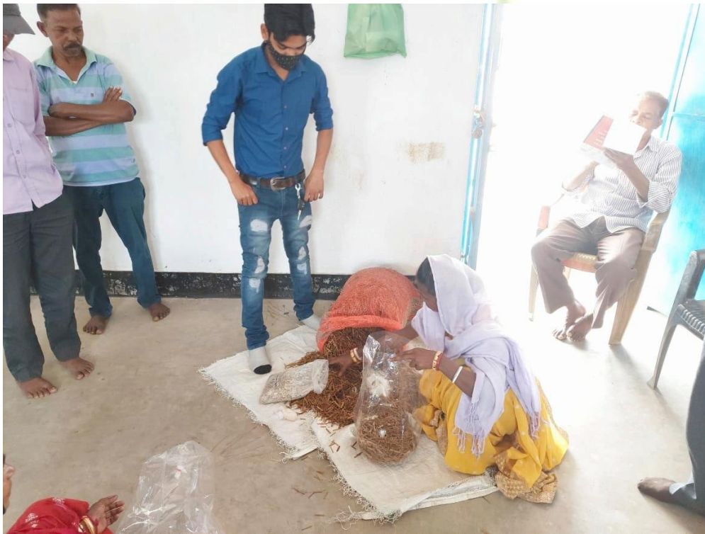
A monitored training stage of one of the participants