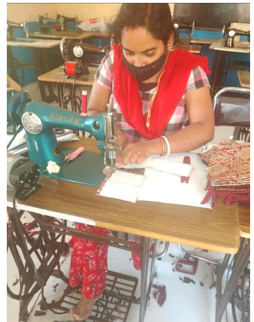
A worker stitching a few bags