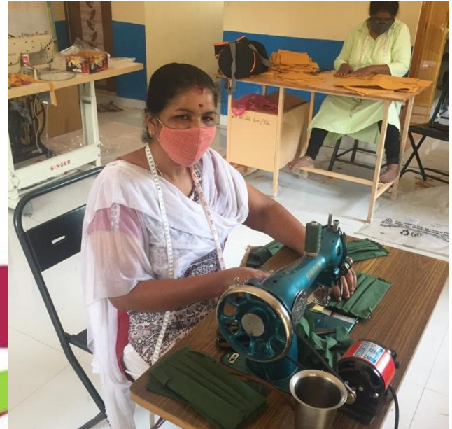
Workers pictured at the tailoring centre

As of November 2020, around 10 underprivileged women have been hired as workers in the centre, and they have collectively made more than 8000 masks. These have been delivered to the vendor.