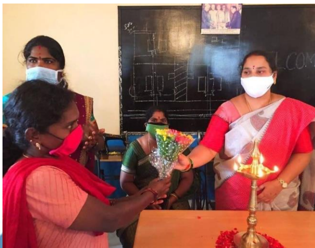
Flowers being handed over by a trainee to an organiser of the training

Keeping in mind the COVID-19 precautions, all the safety protocol – including social distancing measures, hand washing and sanitising stations, and temperature tracking are continually followed at the center.