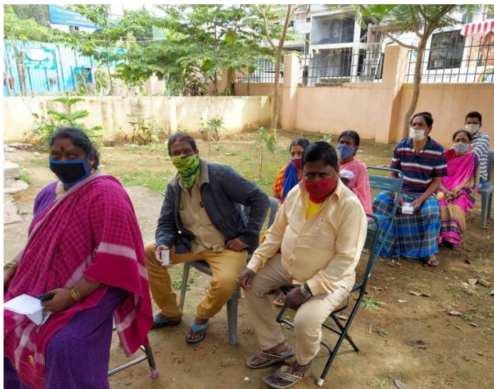
Waiting area outside the mobile unit

The diagnoses showed that such an initiative was much-needed for people to be able to resume their daily lives without hindrances to their vision. There were 25 cases of retrobulbar haemorrhage (RBH), 19 cases of cataract, 24 cases of impaired vision that requires spectacles, and 24 people who needed bifocal corrective lenses. They were suggested treatments and necessary steps accordingly. The follow-up corrective actions shall be taken in within the next 10 days. These include advanced screening, surgery, and distribution of free spectacles. Such initiatives are helpful for underprivileged who cannot afford expensive procedures and medicines.