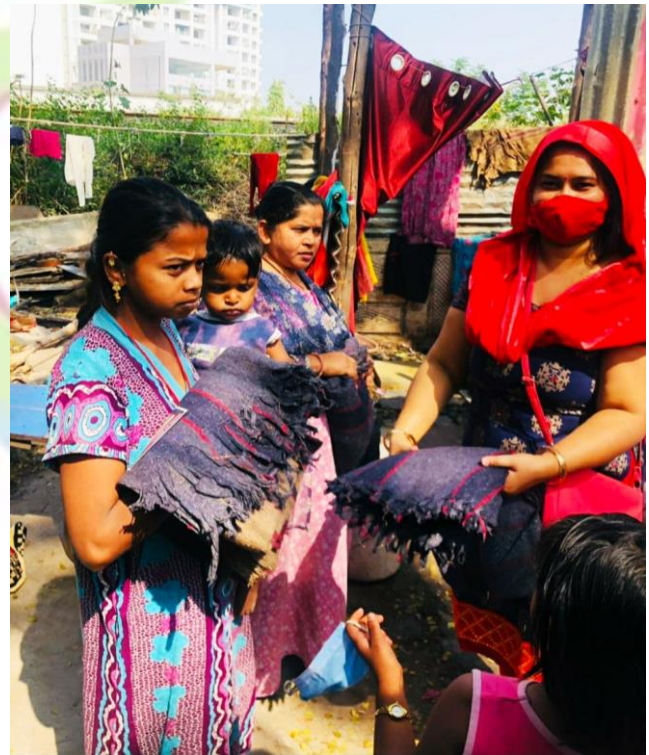
A volunteer pictured at the donation drive