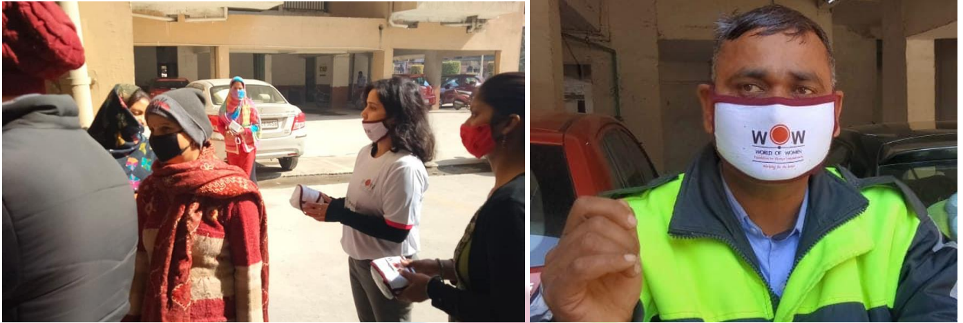
Volunteers and a beneficiary pictured during mask distribution

This drive was conducted in partnership with World of Women (WOW), an NGO focusing on improving women's lives through interventions on physical, mental and financial well-being. Courtesy of their participation, sanitary napkins were distributed by Urjavya volunteers among all the house help, cleaners and guards working in the apartment.