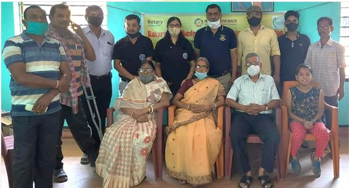
Beneficiaries with Urjavya Foundation team and Rotary Club Dalma members