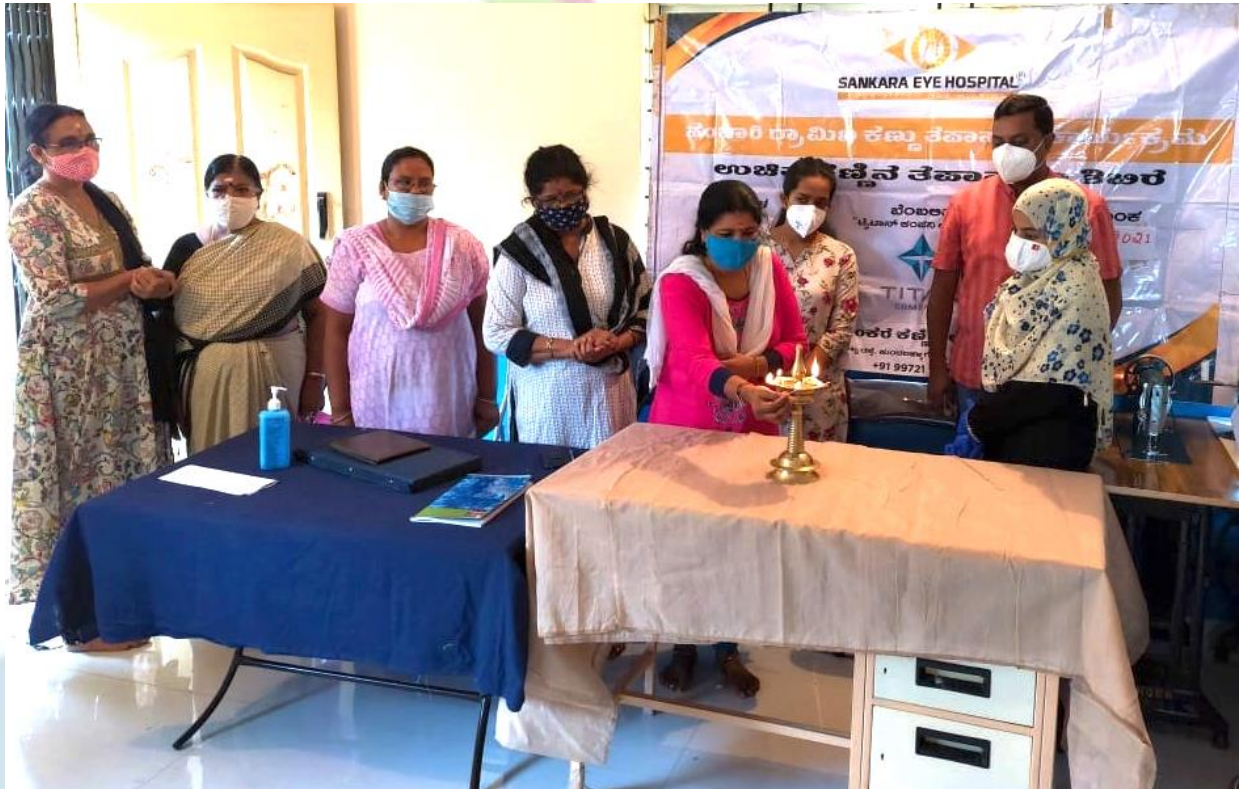
Lighting of lamp to welcome the Sankara Eye Hospital staff into Kudlu

Urjavya Foundation feels privileged to announce that we have added Health Initiatives to our umbrella of programs, and have commenced this initiative with a free eye check-up camp organised in Kudlu, in Bengaluru. Urjavya Foundation collaborated with the Department of Ophthalmology at Sankara Eye Hospital in Varthur Kodi for this camp, following which specialists visited Kudlu to conduct eye check-ups on adults.