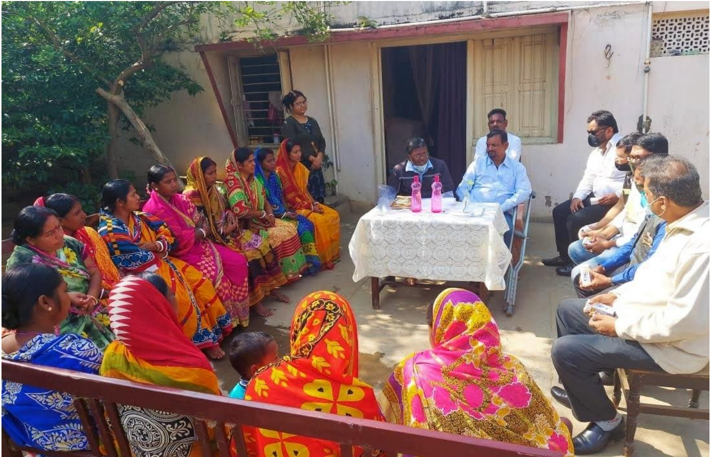
The trainers and participants pictured at the introduced of the program

Mushroom farming can directly improve livelihoods through its economic, nutritional and medicinal contributions. Most mushroom varieties available for farming in India are also highly resistant to frequent weather changes, which makes them one of the ideal and sustainable choices for farming year-round. Urjavya Foundation hopes to continue this program in the future with more participants from varied backgrounds.