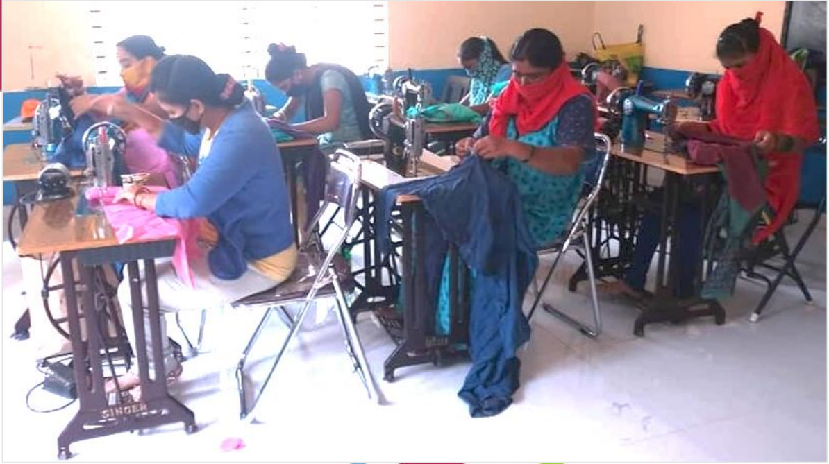
Ongoing stitching process at the tailoring centre