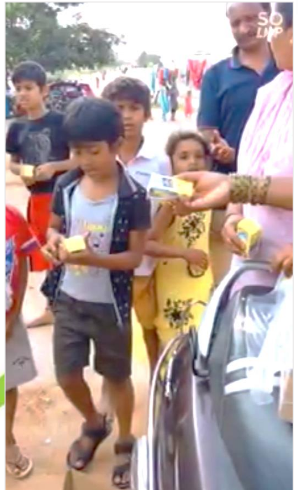
Distribution among Kudlu children, as seen in the video journal of the event posted on our Facebook page