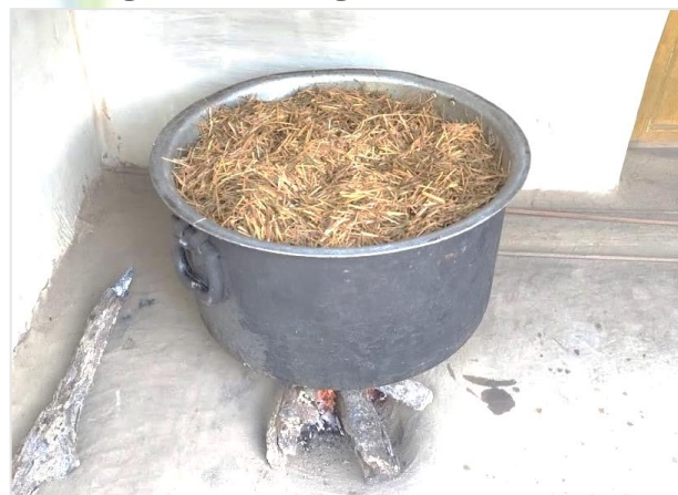
The mushrooms used during the training program being dried manually