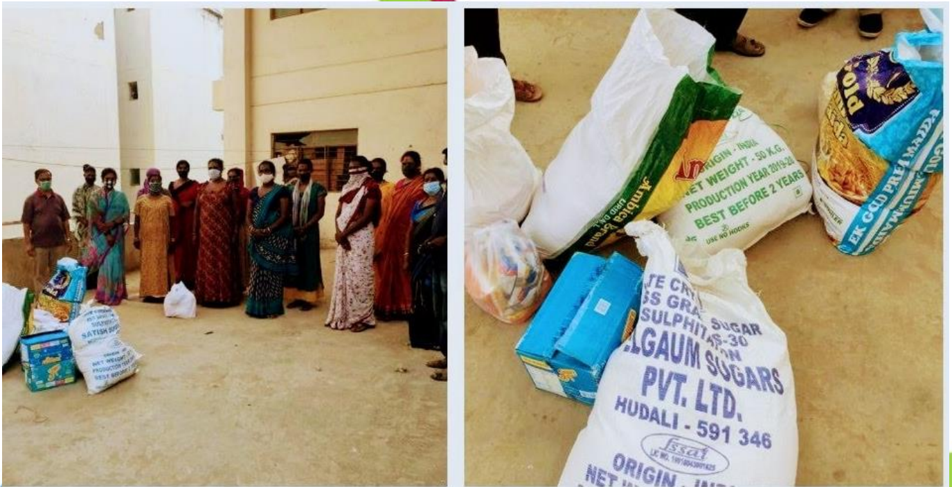
Members of the transgender community pictured with the grocery kits brought in by Urjavya Foundation volunteers

Urjavya Foundation took up this issue in October 2020 and endeavoured to reach out to the transgender community in Bengaluru to help them with procuring enough food and resources to sustain themselves. The volunteers at Urjavya donated grocery kits containing dal, rice, wheat, vegetable oil, and other cooking substances. These were distributed to around 60 members of the community in the city.