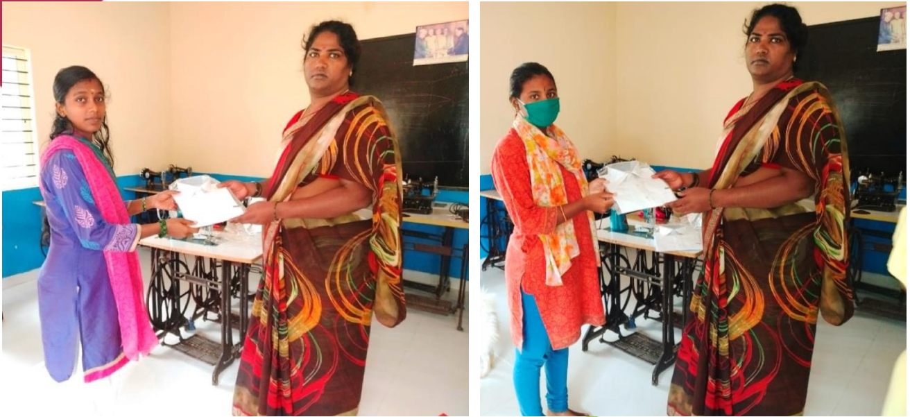
Handing over of gifts to the women participants at the center