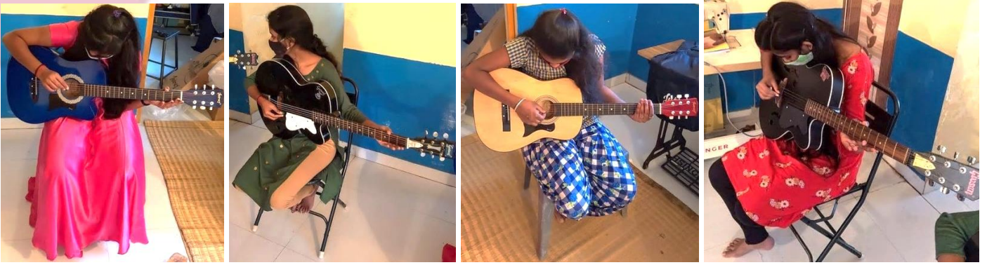
The children from Kudlu pictured at the first guitar class