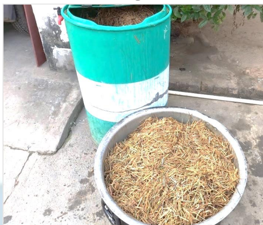
The mushrooms used during the training program before cleaning

As part of our dual efforts in Bengaluru and Jharkhand, a mushroom farming pilot training session was organised by Urjavya Foundation in Jharkhand featuring 15 women who hail from rural areas. They were briefed with the basics and advantages of mushroom farming, and methods for harvesting and storage of the mushrooms.