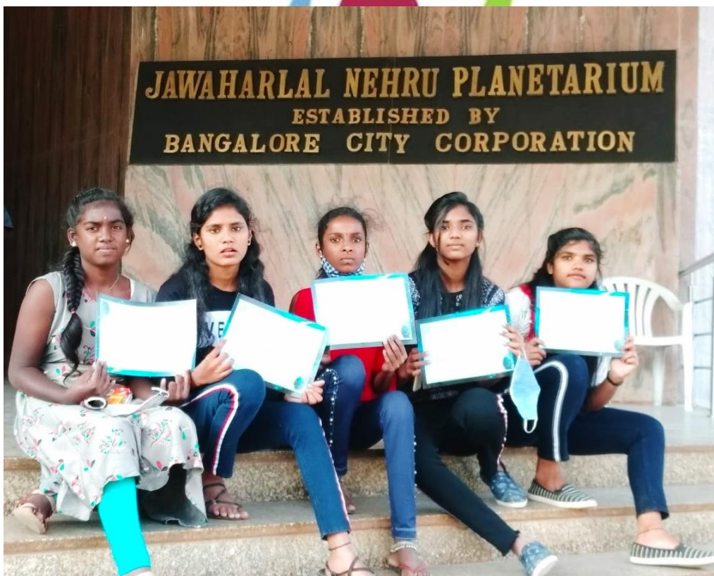
Some attendees were awarded certificates during the event as well