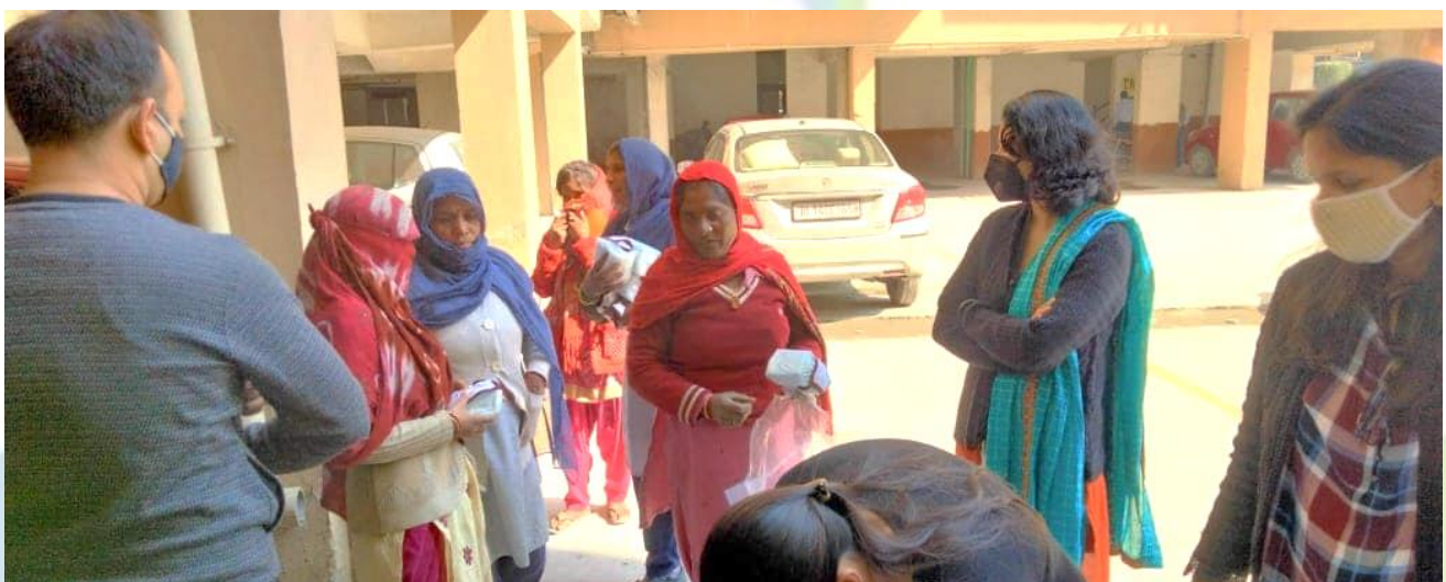
Some of the staff members attending the drive

In India, the conversation around menstruation is often shrouded by outward social stigma, cultural taboos and misinformation regarding women's health. The lack of awareness about women's health is further exacerbated by a lack of access to appropriate menstrual hygiene products and sanitation facilities. Although the outlook on talking openly about menstruation is changing, there are still steps to be taken in this direction. Urjavya Foundation has endeavoured to improving awareness about such issues through our umbrella initiative of Women Empowerment. In ongoing efforts under this program, we recently conducted a sanitary napkin and mask distribution drive among female cleaning and maintenance staff working in La Residentia apartment in Greater Noida.