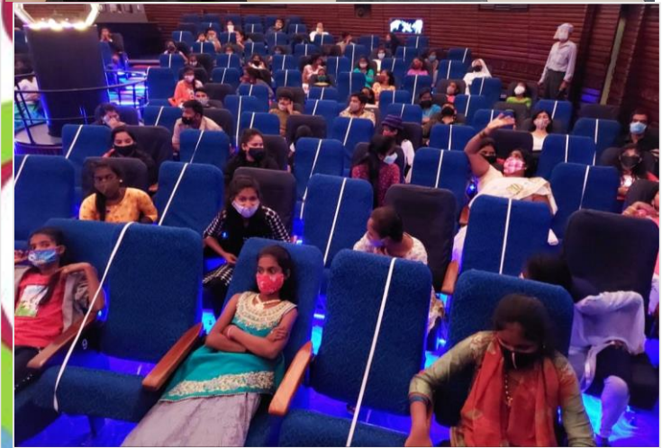
The children receiving an interactive tour of the planetarium