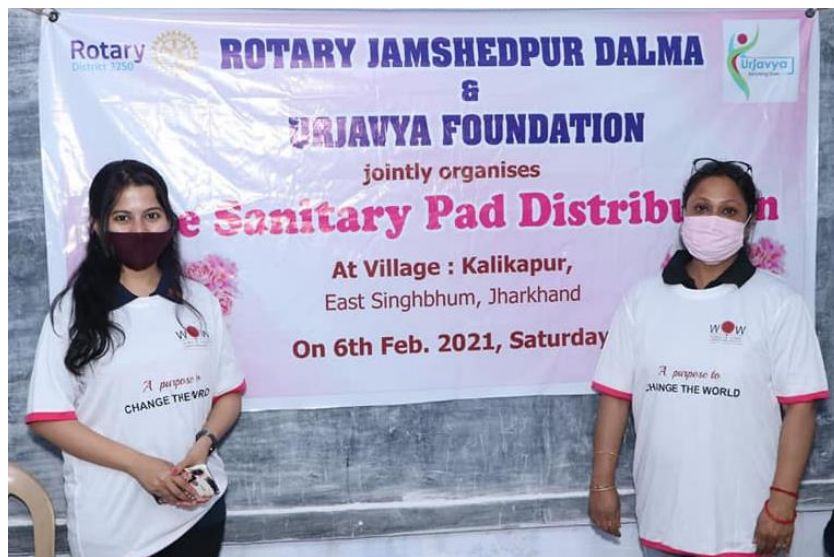
Members of World of Women pictured with the event banner

refreshments, and attendees of the menstrual hygiene workshop receiving free sanitary napkins.