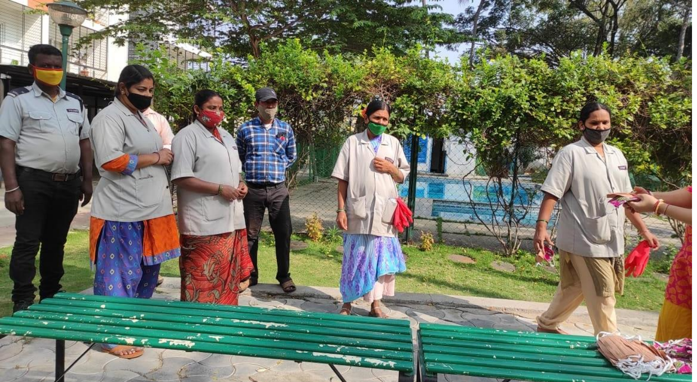
Mask distribution among cleaning staff of the apartment