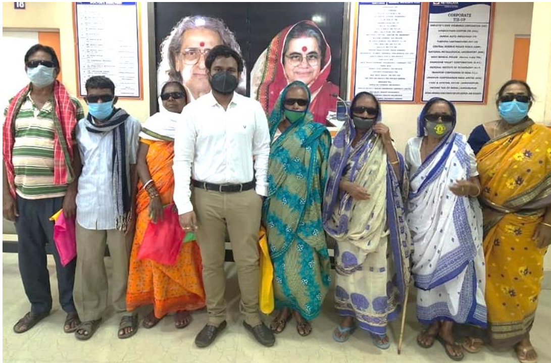
Some of the beneficiaries pictured post-op at Poornima Netralaya

The 18 participants who were identified as requiring cataract surgery at the eye camp in Kalikapur, have successfully undergone the procedure at Poornima Netralaya in Jamshedpur. All of the operations conducted were successful, and follow-up consultations have also been arranged. Urjavya Foundation also spoke to the patients about their experience of the procedure to gain feedback. Urjavya thanks Rotary Dalma and the staff members and doctors at Poornima Netralaya for making this achievement possible. The Urjavya Foundation team shall continue to expand its health care umbrella and conduct health camps.