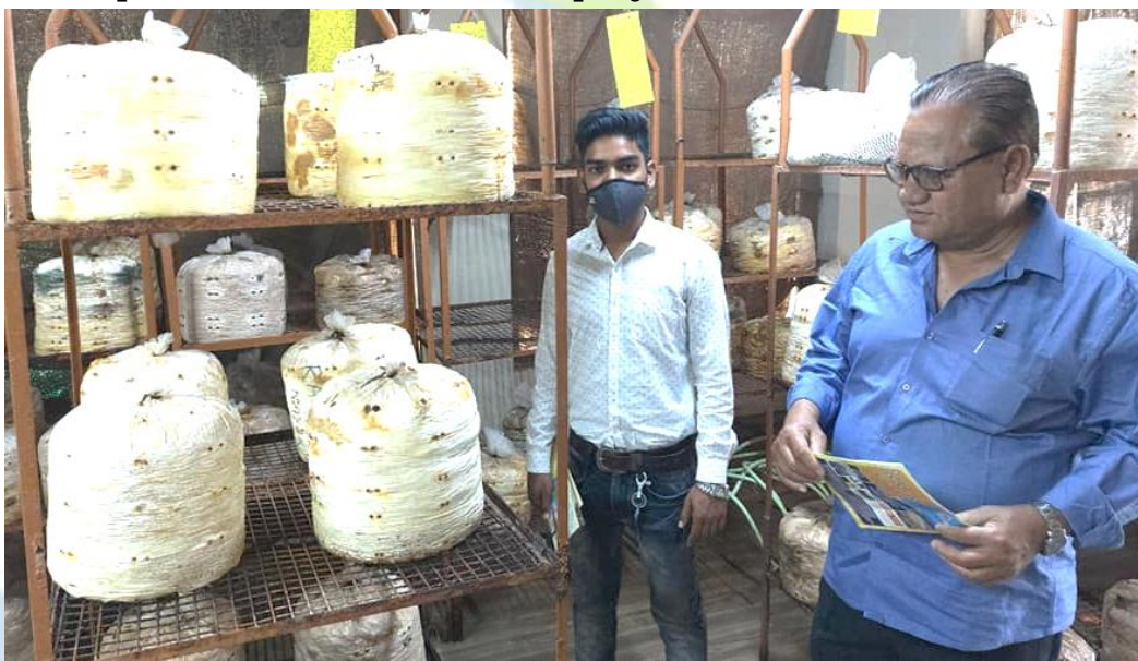
Urjavya Foundation team visiting the agricultural repository of the university

We met with faculty and students at the university to discuss knowledge transfer programmes with them. We even encouraged the university students to work with us as interns to promote rural livelihood projects.