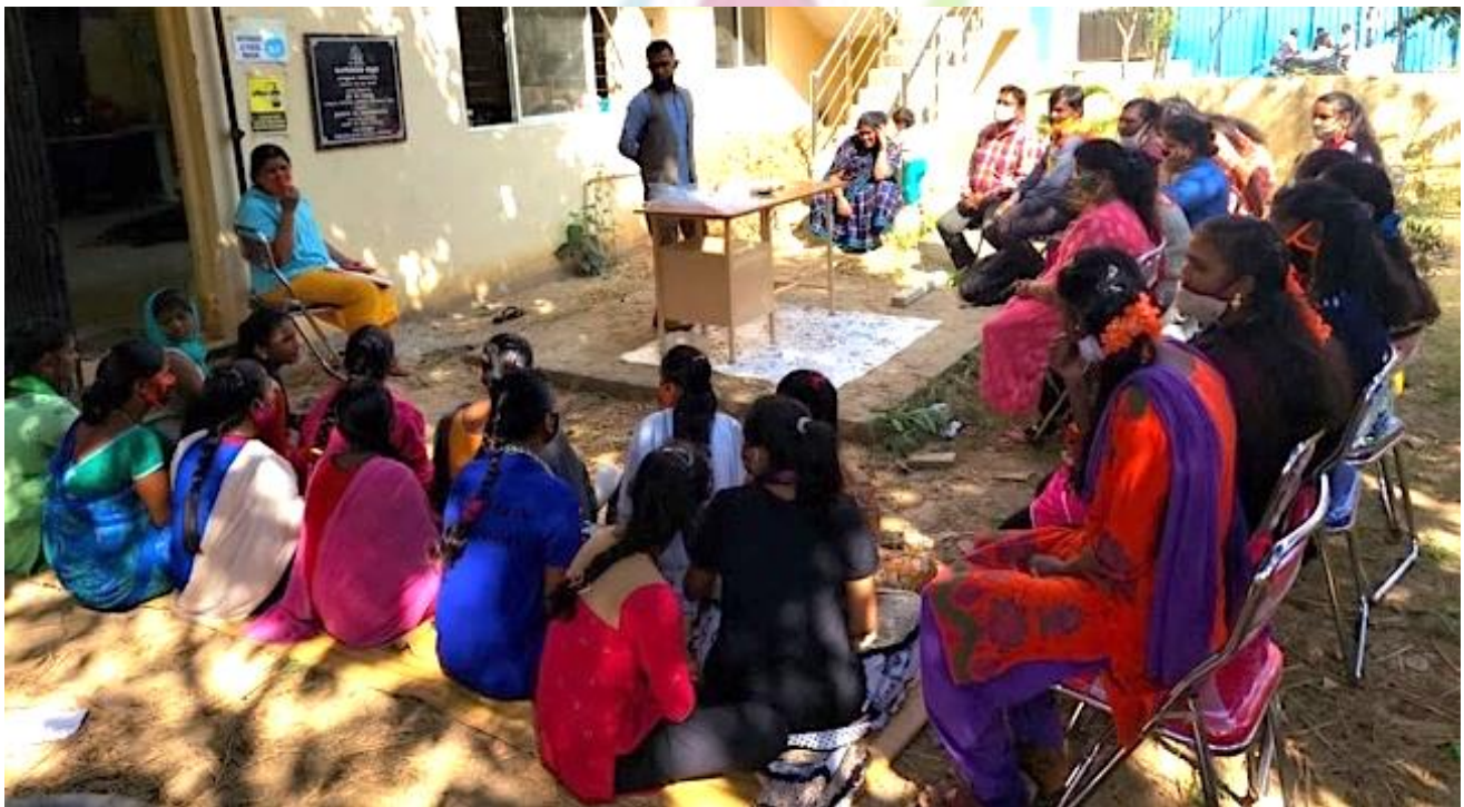
Trainees attending the introductory session