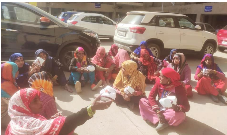
Beneficiary women pictured during the sanitary napkin distribution