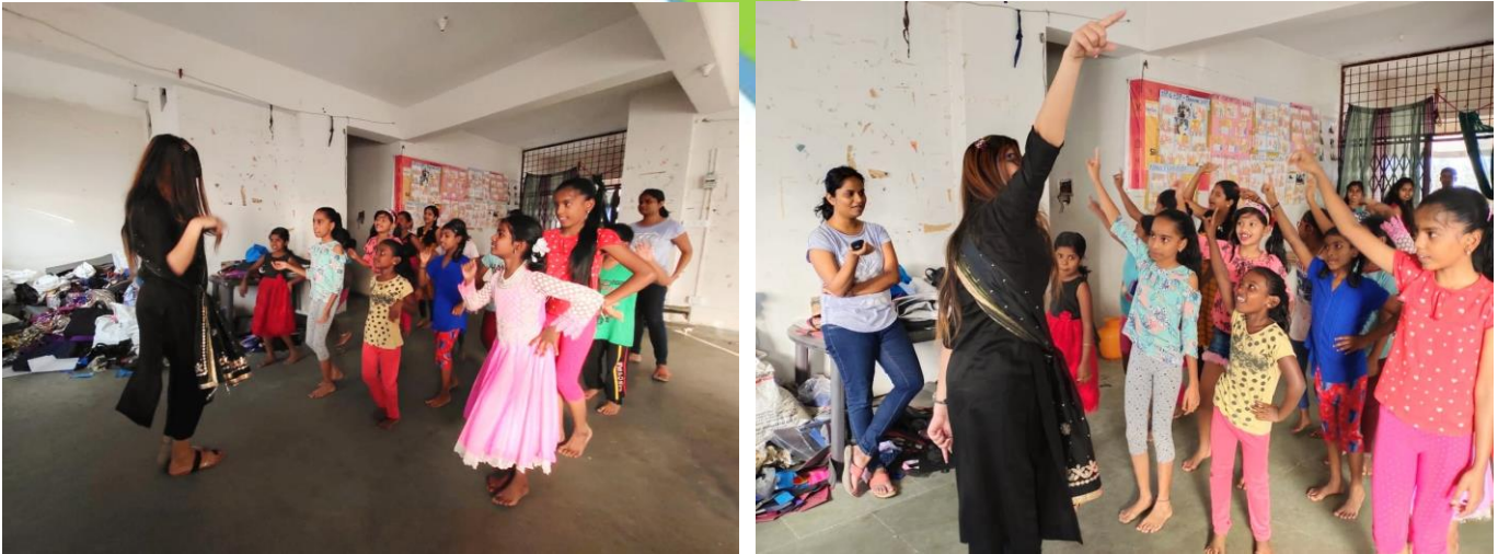
Dance instructor conducting the class for the enrolled children

To recognise the importance of creative and expressive mediums like dance among such children, Urjavya Foundation organised a dance workshop and class for Kudlu community's children as part of the ongoing 'Happiness Program For Kids'.