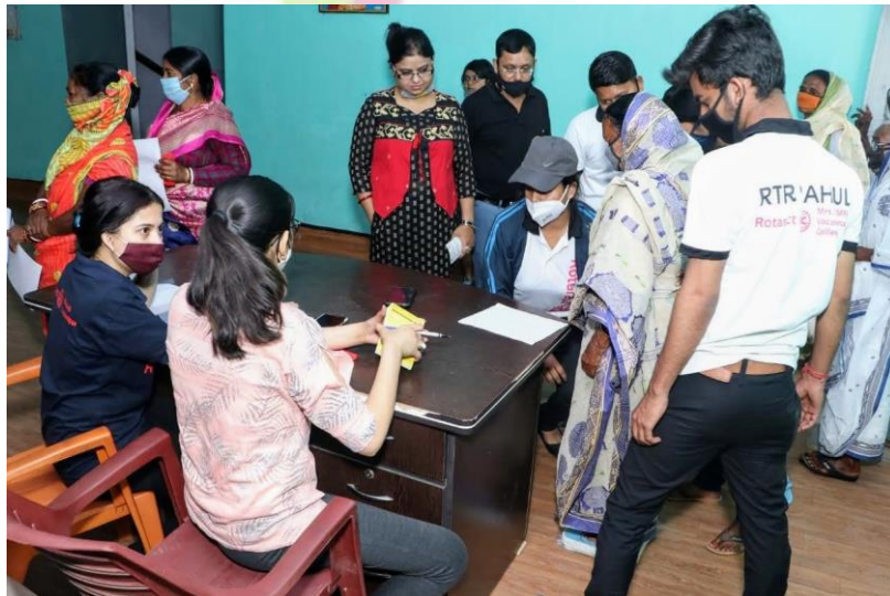
Images from the check-up camp in progress