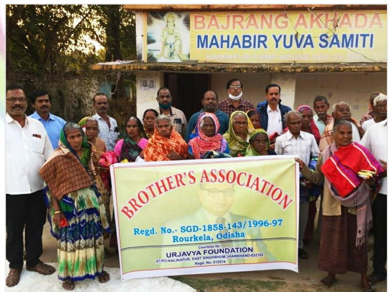
Some of the blanket distribution drive participants pictured with members of Brother's Association