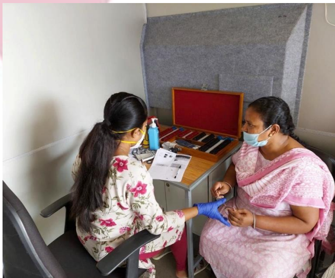
General physician consultation of one of the participants