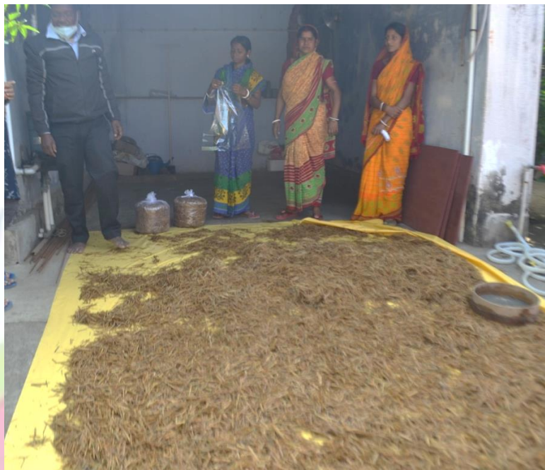
Trainees observing the mushroom-drying process before storage