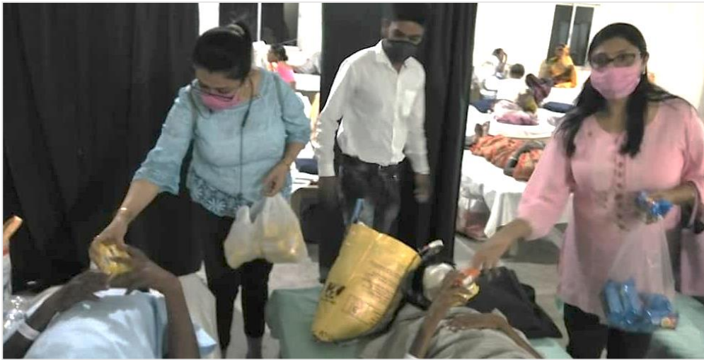
Urjavya Foundation and Rotary Dalma team members distributing food items to patients