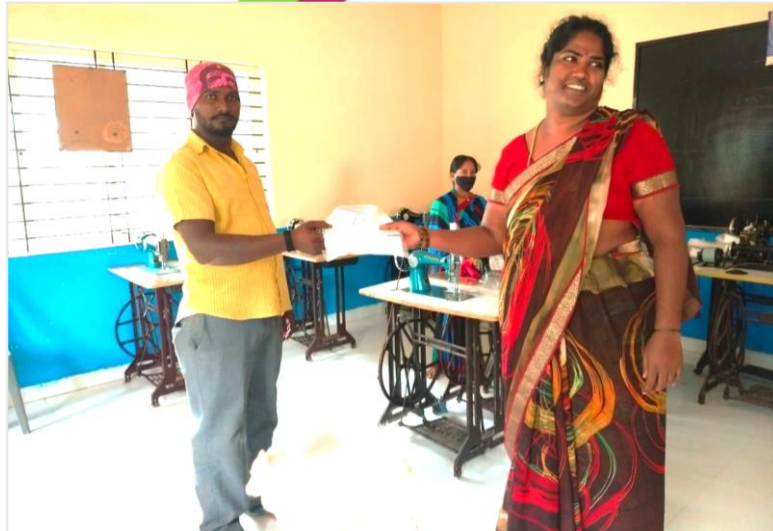
Gifts being given to the male members of the women's families