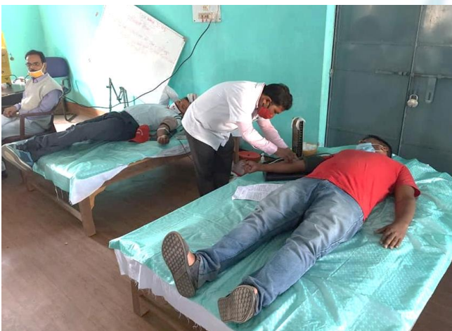
Donors at the blood donation camp