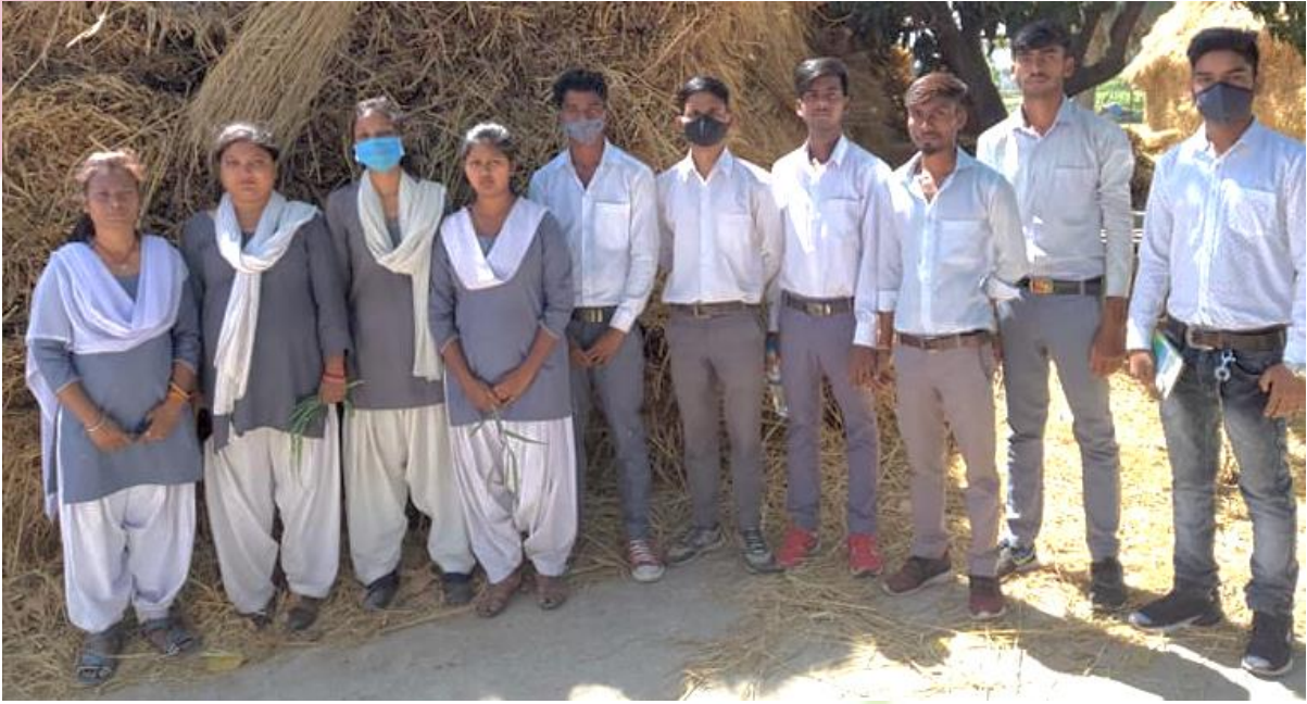
Students at the University with whom discussions were held