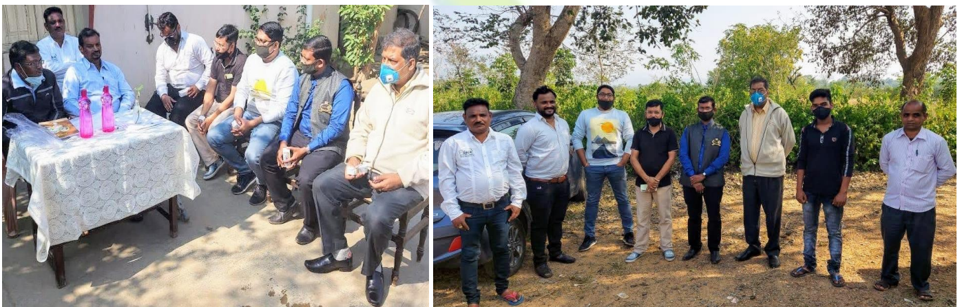
Images from the discussions held between Urjavya Foundation and Rotary Club members