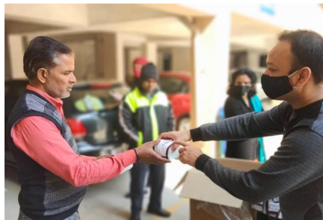
Security guard receiving a mask from a volunteer