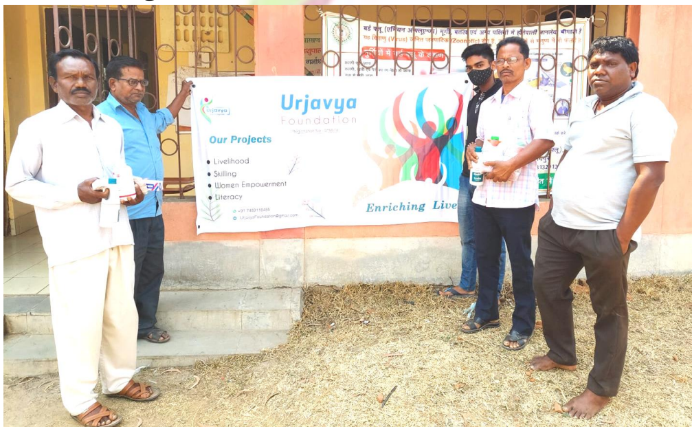
Villagers with Urjavya Foundation volunteers at the Block office

Urjavya Team has begun a pilot initiative to assist villagers in Jharkhand at the grassroots level by fostering education and awareness of schemes and skills that they can avail for their benefit. Along with two identified villagers from Kalikapur, our volunteers visited agricultural and veterinary officials as well as the Block office to learn about the various government programmes for rural upliftment. They also received information on programmes such as free soil testing, using tools, goat husbandry, fishing, pig farming, and poultry farming. Urjavya Foundation thanks its ground volunteers for their assistance to the villagers.