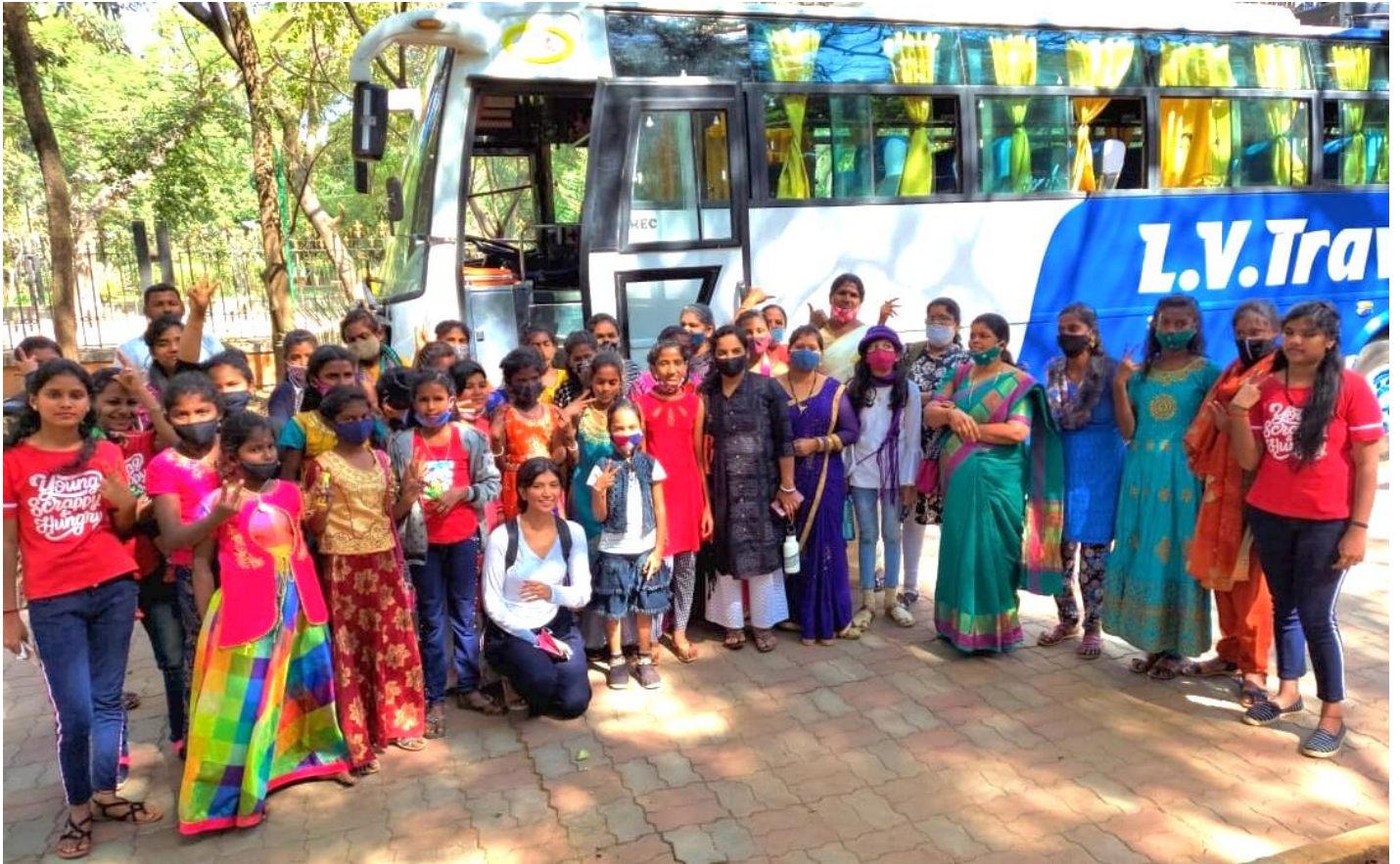
Children photographed with the coordinators for the Planetarium visit

Urjavya Foundation has always aimed at increasing the quality of life of the individuals we are closely connected to as our beneficiaries. Our aim is thus to provide children every possible and apt opportunity so that they can feel a sense of belonging collaboration and support from the larger community, and can believe in themselves and their ability to reach their full potential.