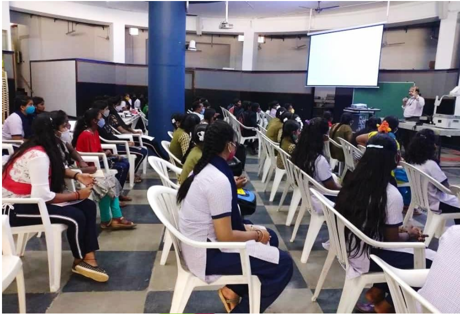
An ongoing science workshop at the planetarium

Many research studies show that students can retain 80% more knowledge through experience-based learning than in a lecture setting. Urjavya Foundation seeks to provide poor children with such hands-on experience to help them understand diverse scientific ideas and foster creativity. It will make learning enjoyable and stimulate their imagination. Recently, Urjavya Foundation organised a joint partnership with the JLN Planetarium to allow the girls from Kudlu to attend a day of the Science Workshops.