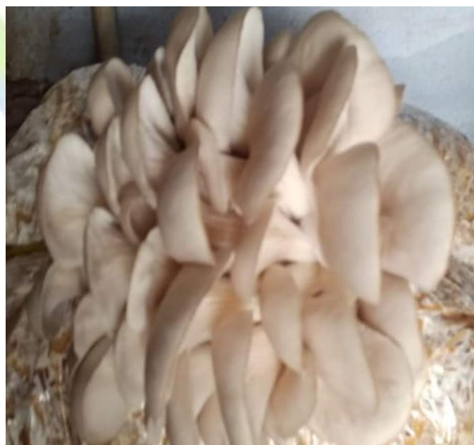
Close-up of a cluster of mushrooms