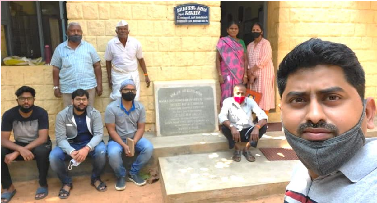
Some beneficiaries and volunteers pictured at the donation drive