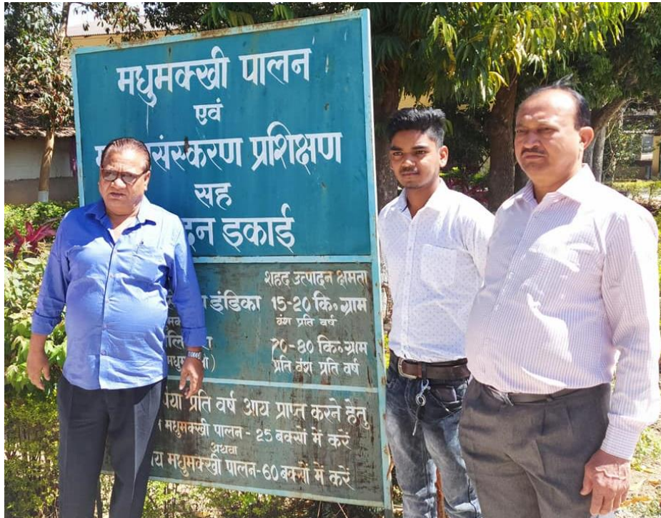
Urjavya Foundation team at Birsa Agricultural University

With the goal to continue mapping a path for encouraging micro-entrepreneurship in agriculture at the village level, the Urjavya Foundation Team visited the Department of Veterinary and Animal Husbandry of Birsa Agriculture University in Ranchi, Jharkhand.