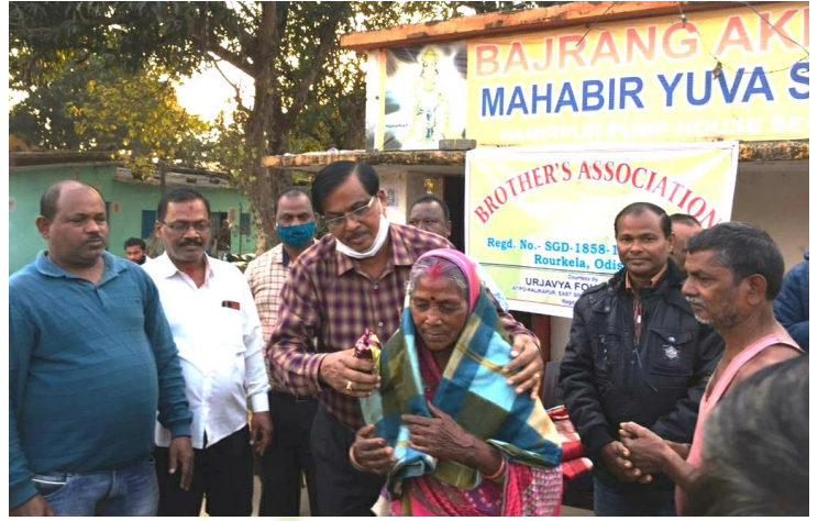
Beneficiaries receiving blankets from members of Brother's Association