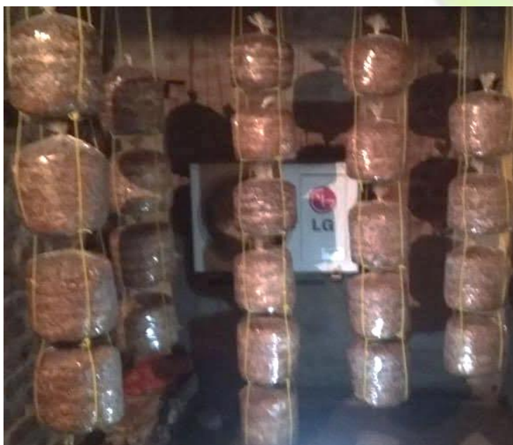
Mushrooms hung up in tightly knotted wrapping for drying