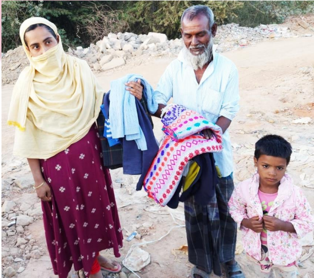
Beneficiaries pictured with the blankets near their temporary homes