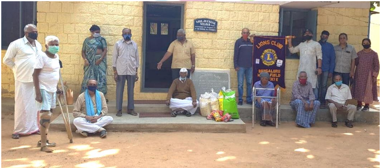
Beneficiaries pictured with members of Urjavya Foundation, YFS and Lions Club