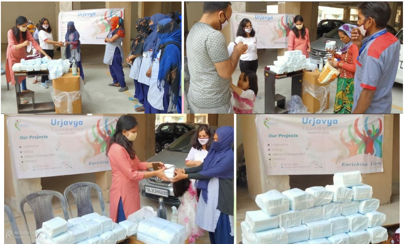
Images of resources and attendees from the drive