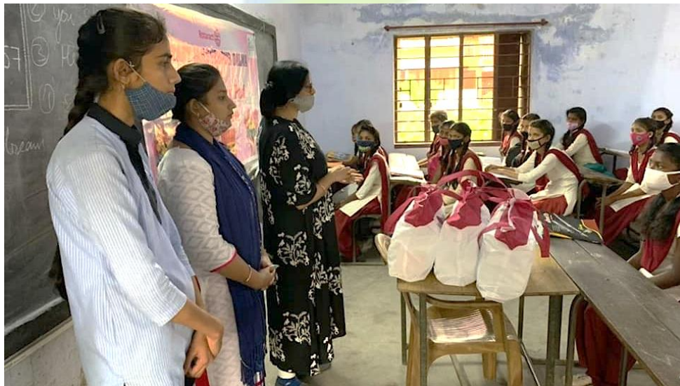
WOW Members giving a talk to the students about menstrual hygiene