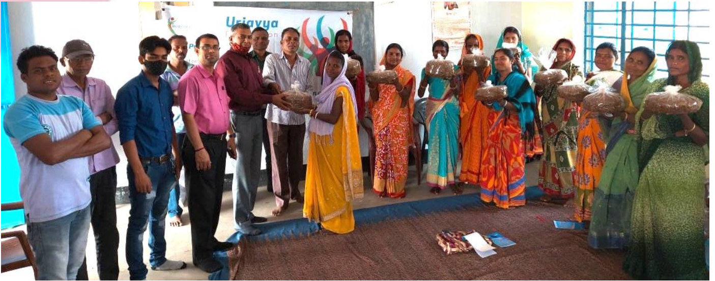
Attendees receiving training kits from the organisers