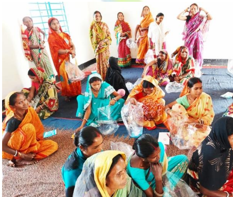
Attendees pictured with their mushroom training kits