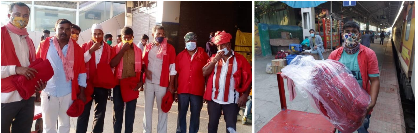
Beneficiaries at the Yeswanthpur Railway station

Recently, the blanket donation drive by Urjavya Foundation made ripples in Bengaluru as well. Multiple workers at the Yeswanthpur Railway Station were given blankets to help them take on gruelling shifts of work in the cold better.