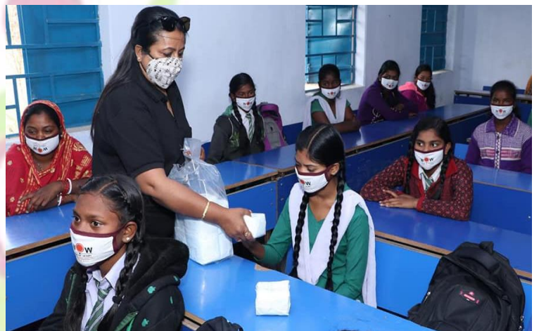
Sanitary napkin distribution among attendees of the workshop