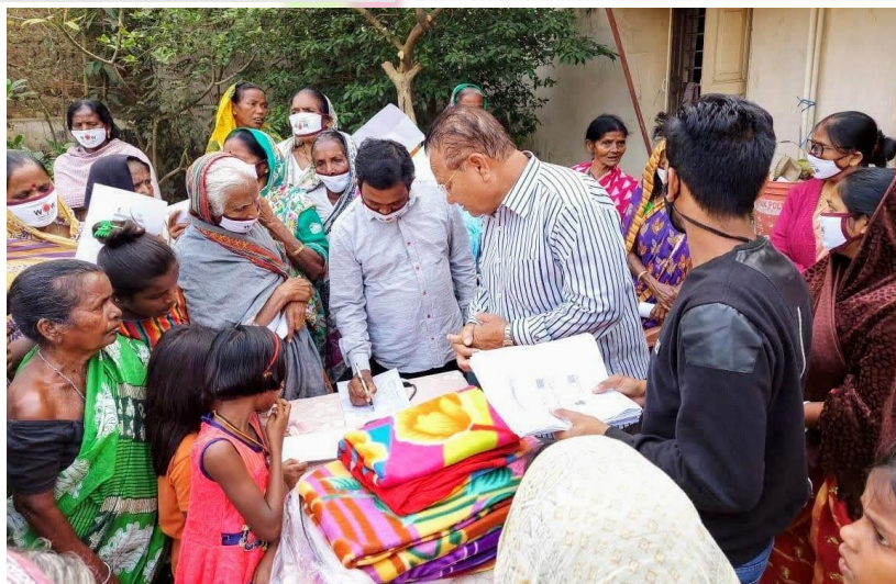
Individuals receiving blankets from the donors