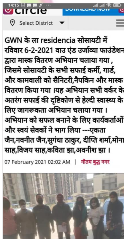
Screenshot of the article on Circle

Urjavya Foundation has even organized a workshop about menstrual hygiene and the usage of appropriate and safe modes of menstruation. The beneficiaries from this program were numbered at more than 100 men and women. Circle, an online news-sharing company based on local networking, also posted an article about the drive.