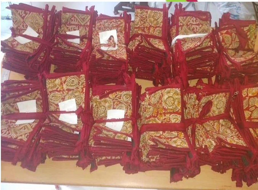
The bags pictured before they were sent out for delivery to the vendors

Resuming the empowerment and exposure that we have been providing to the participants from Kudlu and their handmade deliverables, we have delivered 350+ cloth handbags to our NGO partner. 12 participants from the women empowerment initiative hand-stitched these bags at our centre in Kudlu. The vendors were highly satisfied with the quality, design and durability of the bags.