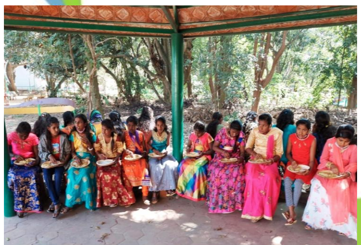
Children pictured with the meals arranged for them as part of the planetarium visit