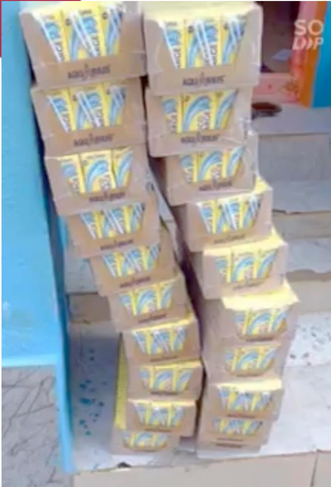
Donated juice boxes before unpacking and distribution by Urjavya volunteers, as seen in the video journal of the event posted on our Facebook page