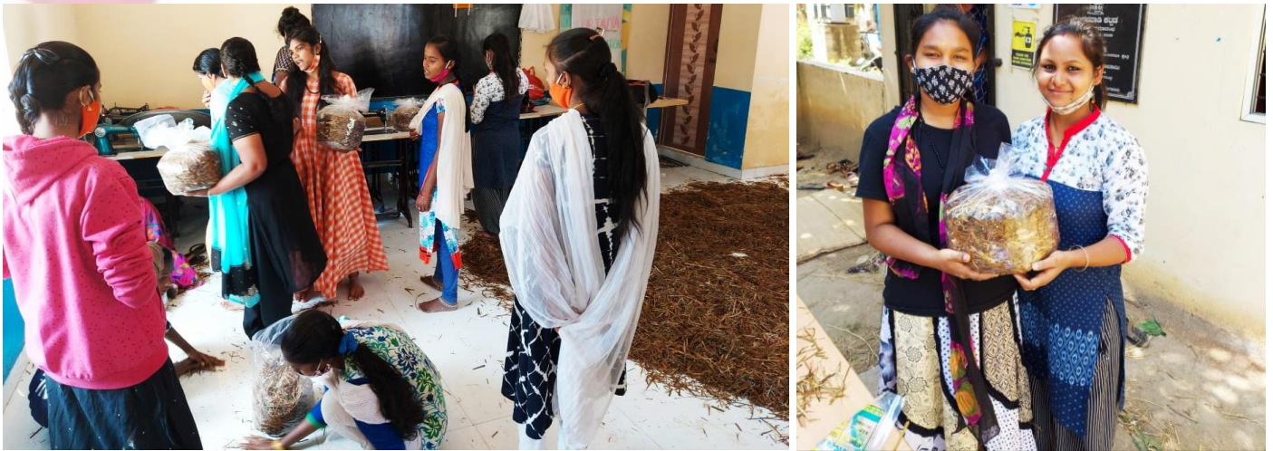
Trainees pictured during the drying process

encouraging them is our motto, and the team at Urjavya Foundation continues to be dedicated towards the same.