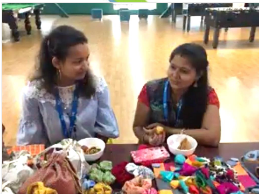
Glimpse from the video journal of the event made and posted by Urjavya Foundation on our Facebook page

In a milestone achievement for Urjavya Foundation, our first ever corporate collaboration was held with CSG at Prestige Tech Park, Bengaluru to foster the endeavours of the women employed at the Urjavya Foundation-established tailoring centre in Kudlu, Bengaluru. As a pilot program, this collaboration saw 5 women setting up stalls to sell many stitched products, which they made from cloth scraps that are discarded by boutiques and clothing stores.