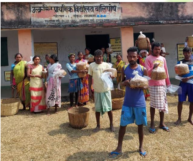
Participants at the location of the training in Baaliposh