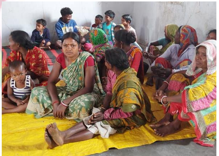
Some of the trainees pictured at the commencement of the session