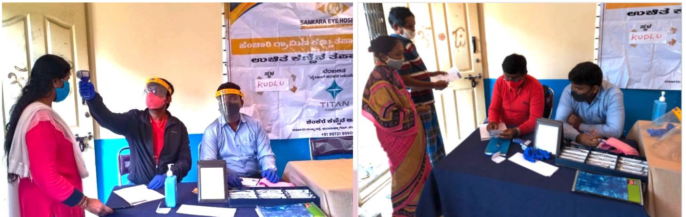
Screening and documentation process before commencement of the eye examinations

76 participants from the community were enrolled in this eye camp, and were ensured that they shall undergo rigorous and comprehensive tests to ensure the best treatment and diagnosis of their vision. They were all also screened using Handheld infrared temperature readers before being sent for the examination, in adherence with government protocol to prevent the spread of COVID-19. Sanitisation stations were also set up around the location.