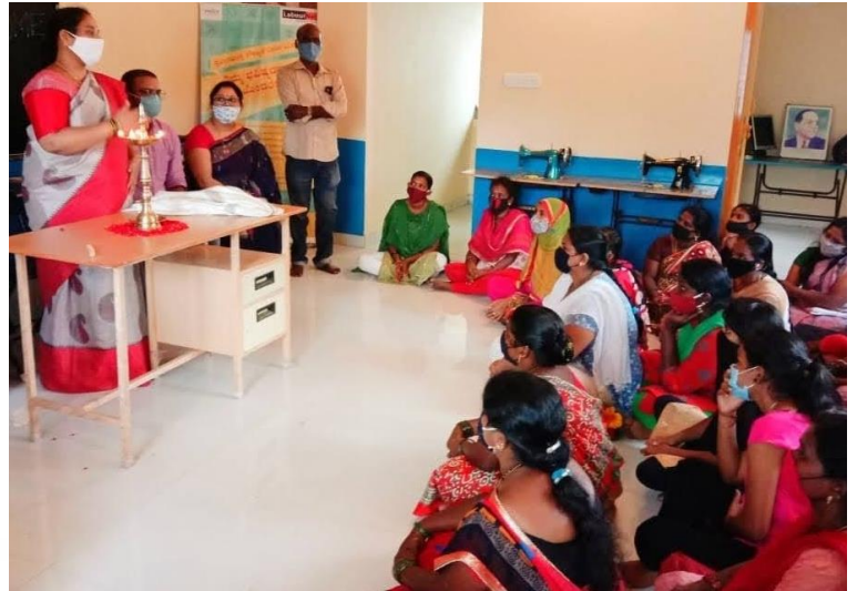
Training session commencement at the center