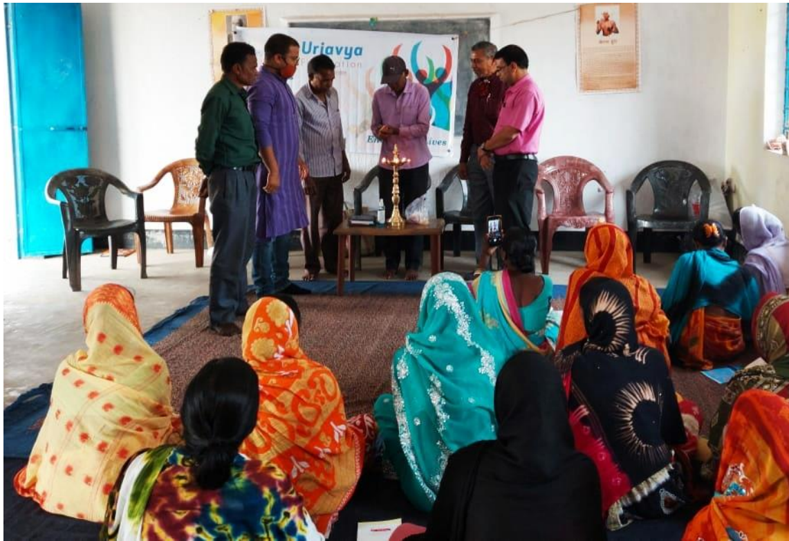
Lighting of the inaugural lamp at the event

Continuing the Jharkhand drive, Urjavya Foundation conducted an oyster mushroom training session in the village of Dhoodhkundi, which overviewed 30 women from rural background.