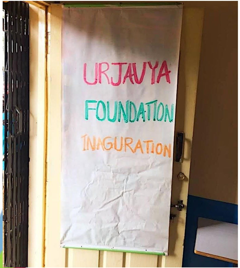
Urjavya Foundation Inauguration Banner hung at the entrance of the center

Keeping in mind the COVID-19 precautions, all the safety protocol – including social distancing measures, hand washing and sanitising stations, and temperature tracking are continually followed at the center.