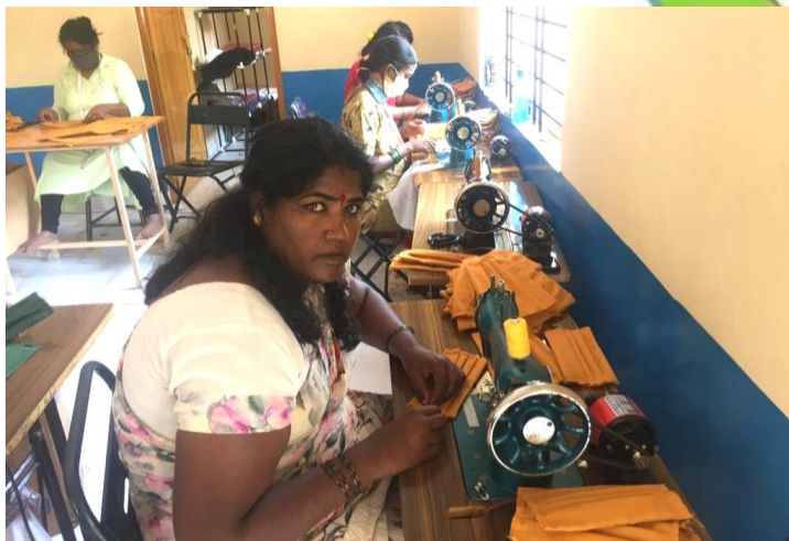
Workers at the tailoring centre

As of November 2020, around 10 underprivileged women have been hired as workers in the centre, and they have collectively made more than 8000 masks. These have been delivered to the vendor.