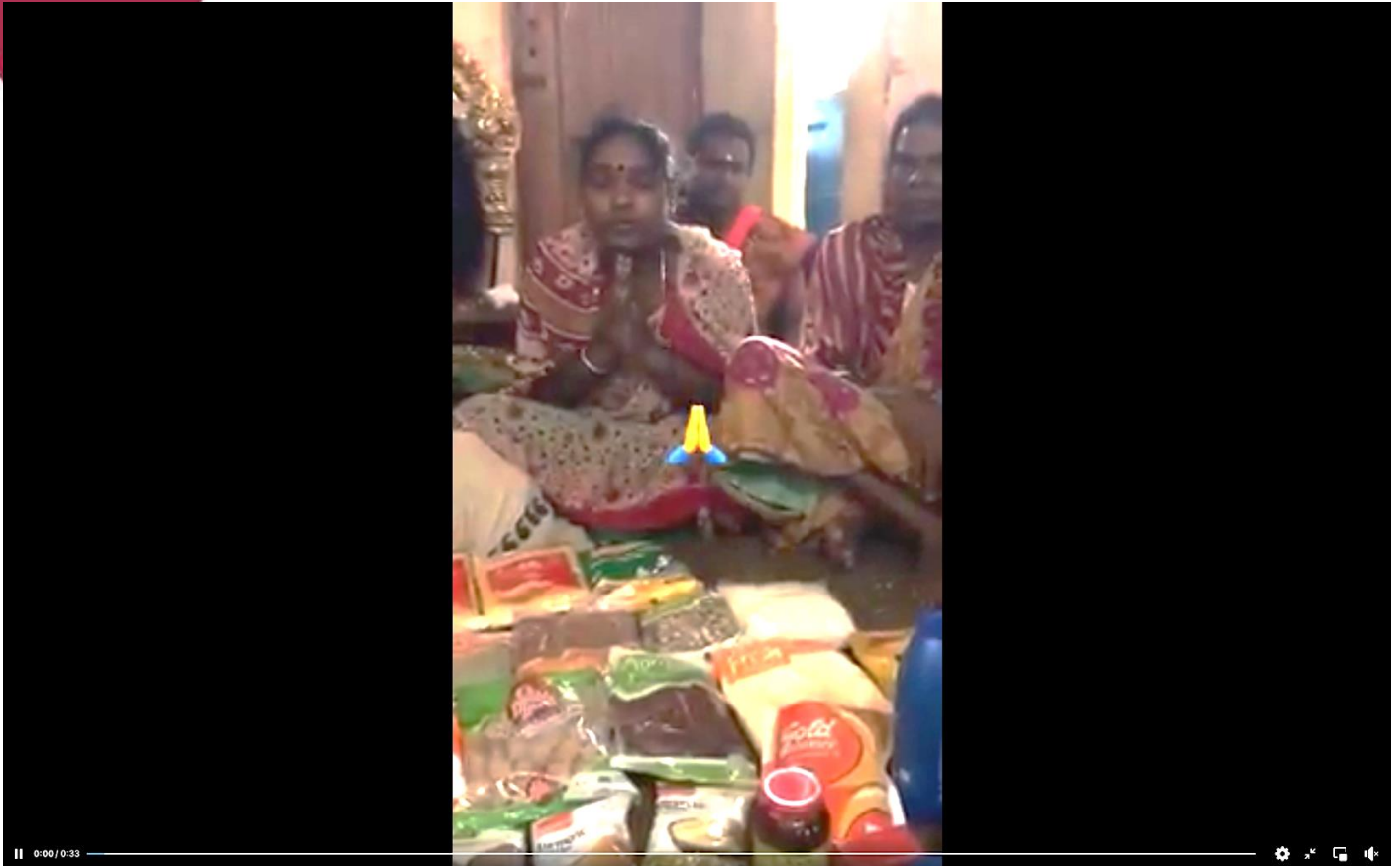
Video made by the beneficiaries to thank Urjavya Foundation URL: https://www.facebook.com/watch/?v=2595824293990122