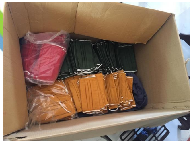
Hand-stitched masks being packed into boxes to be sent to the vendors

Urjavya Foundation hopes to expand operations at the centre soon and add more products to the portfolio of the workers. The NGO thanks all the participants who have made this initiative successful so far, and have proved the efficiency of grassroots level efforts.