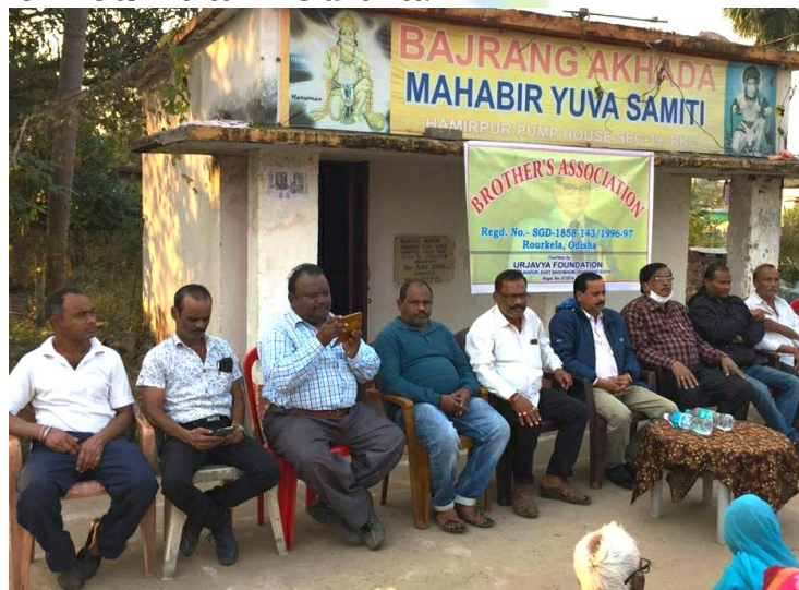
Members of Brother's Association meeting before the drive

Continuing the blanket distribution drive, Urjavya Foundation has extended their initiative to the city of Rourkela in Odisha.