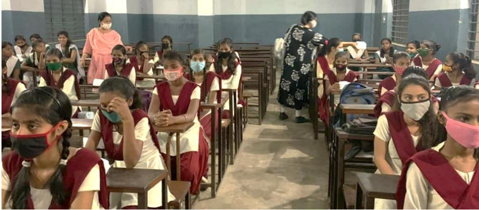
Distribution of sanitary napkins to the students