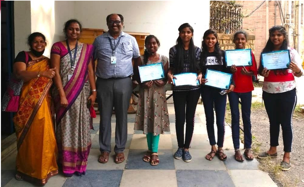
Few attendees pictured with organisers of the JLN Planetarium event