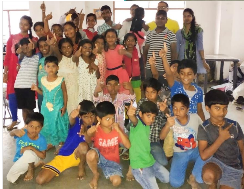
Photographs of children post the workshop

Urjavya Foundation also aims to eventually begin regular guitar classes to add on the endeavour of our 'Happiness Program For Kids'.