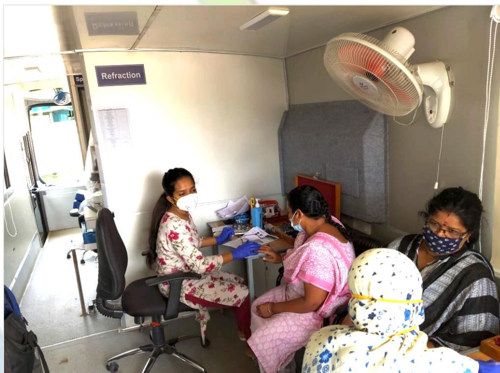
Mobile unit for conducting the eye check-up procedures

Sankara Eye Hospital staff set up a mobile unit near the location of the testing in order to conduct the actual procedures. The details of the participants were also undertaken to ensure that they could be contacted in case of follow-ups or other recommendations. Case histories were also undertaken to ensure that best possible treatments are suggested to the participants.