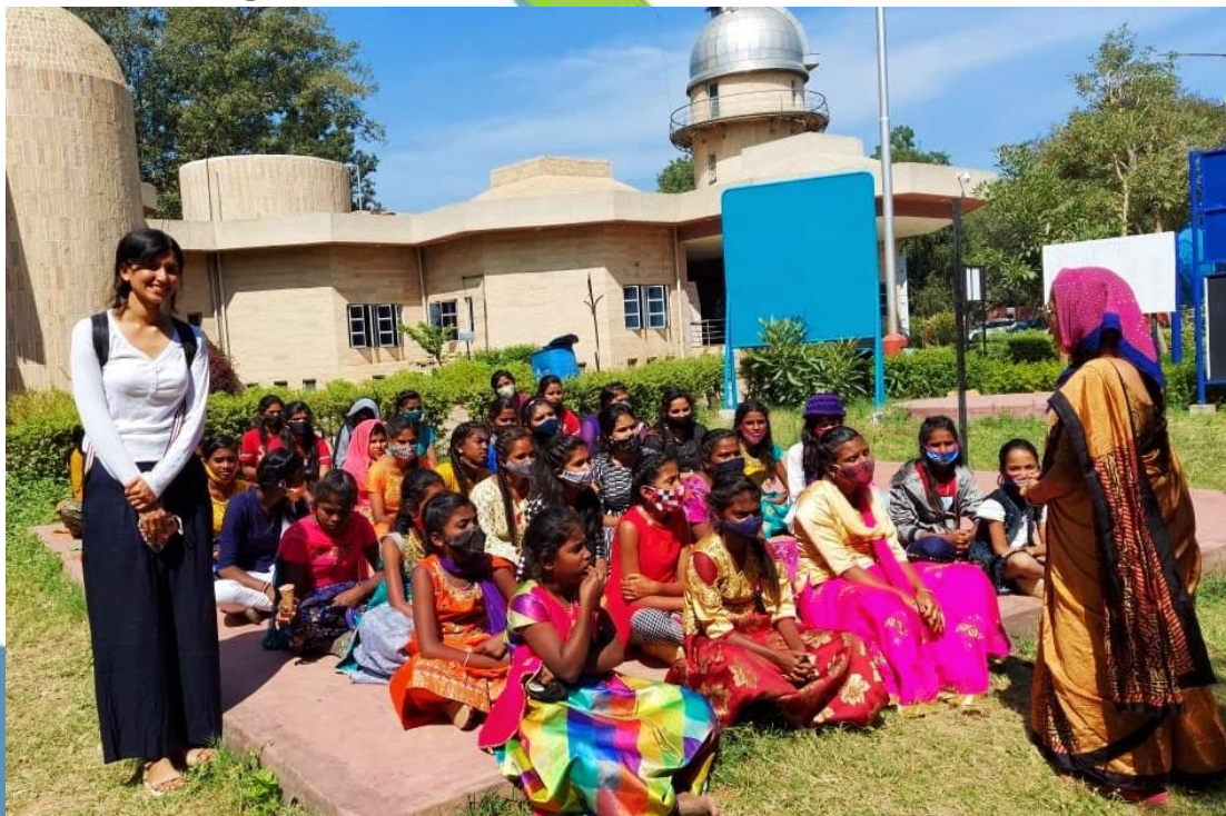
Children photographed at the introduction of the tour

Continuing our 'Happiness Program For Kids', Urjavya Foundation recently arranged a road trip to the Jawaharlal Nehru Planetarium in High Grounds, Bengaluru for girls from the Kudlu community. The Planetarium serves as a nucleus of non-formal science and imparting its education to individuals of all levels. Their endeavour is to create a youth that are able to identify and nurture their creative talents in science so that they can pursue rewarding careers in research and teaching.