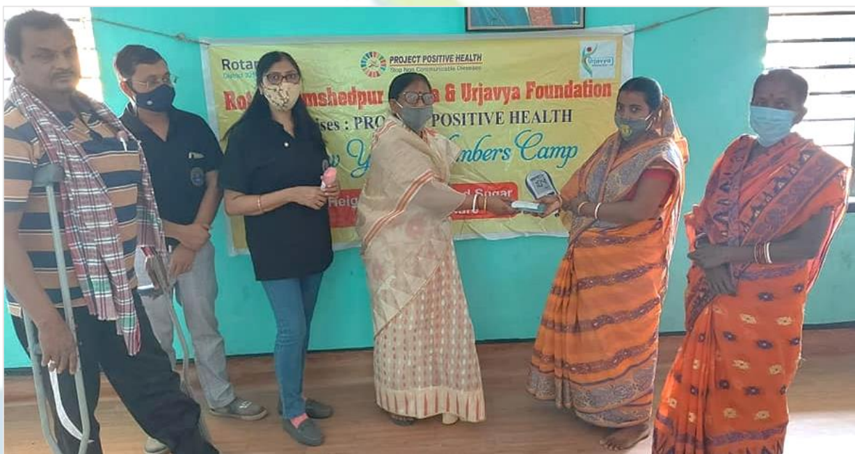
Distribution of glasses to some of the beneficiaries