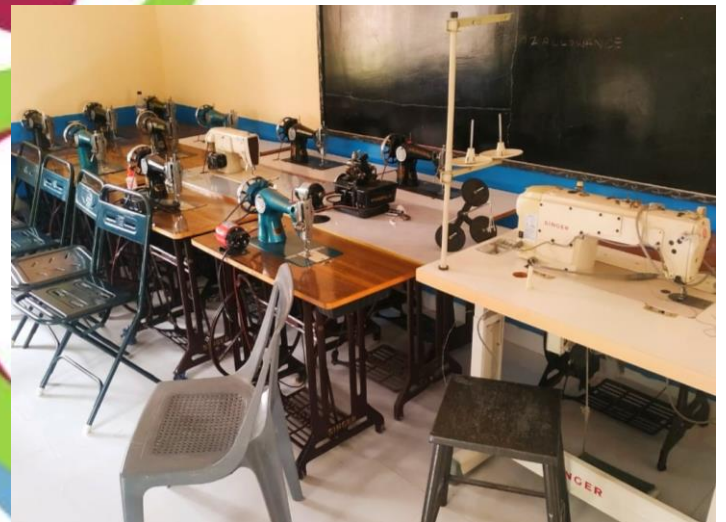
Sewing machines and working equipment shown at the tailoring centre