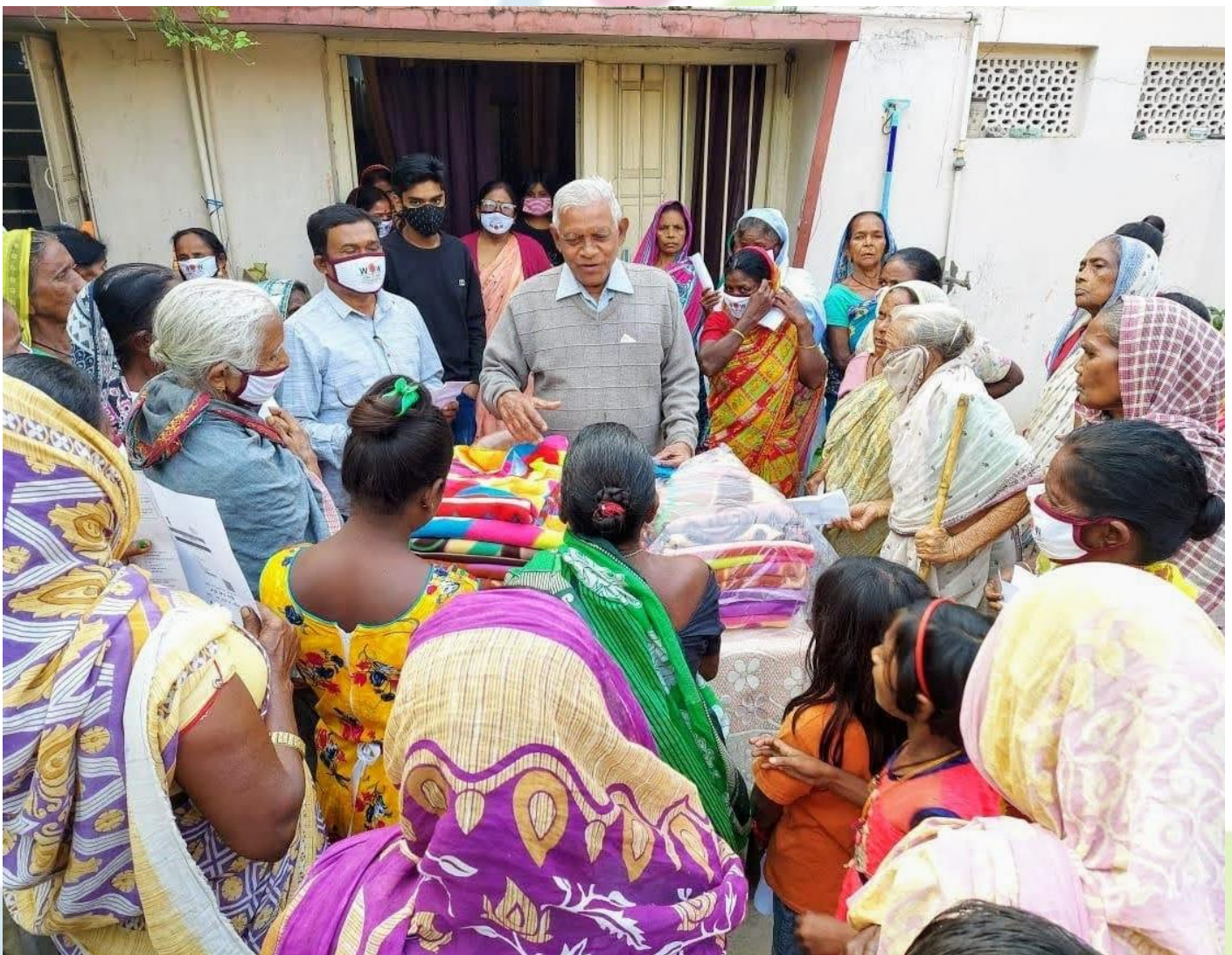
Blanket distribution among the needy

As part of our Jharkhand initiatives, Urjavya Foundation recently donated blankets among poor people across rural belts of Jharkhand to help them combat the exceedingly low temperatures this winter. Our initiative primarily focused on widows, but donated blankets to other individuals who are homeless or in deficit of the resources they need to survive the harsh temperatures as well.