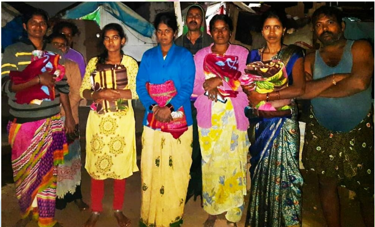
Beneficiaries pictured with the blankets post the drive